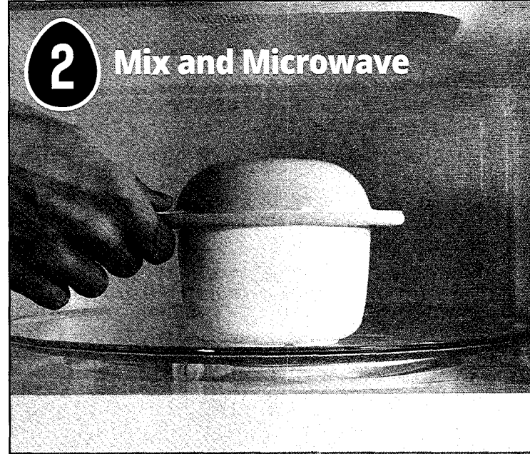
2 Mix and Microwave

Crack open up to 4 eggs on the shell cracking prongs and add, with any desired ingredients, into Incrediegg bowl.